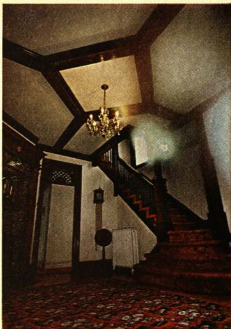
"Footsteps on the stairs . . . watching eyes . . . voices in empty rooms . . ."

Cyn was not scared or even upset. She had just hoped to sleep in later during the pending Christmas holiday. The plan we hit upon was not